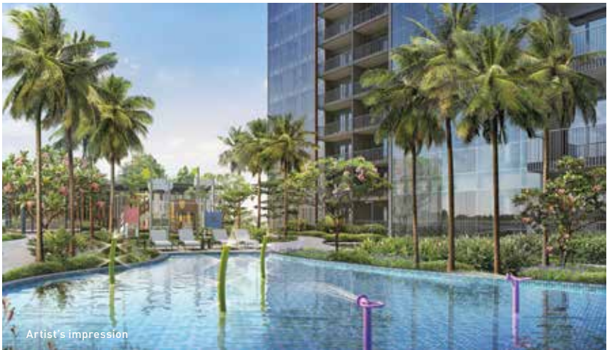
Children's Play Pool

Plunge into the Family Pool for a leisurely swim. Lounge in the clubhouse while the kids have a good time splashing about in the Children's Play Pool. Or join them in water games with in-built water play equipment.