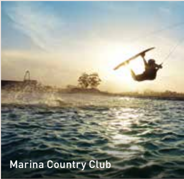
Marina Country Club

From trekking, wakeboarding, and yachting opportunities to cafe-hopping options amongst trendy eateries, Punggol is quickly becoming the definitive hangout for both exercise enthusiasts and fanatic foodies.