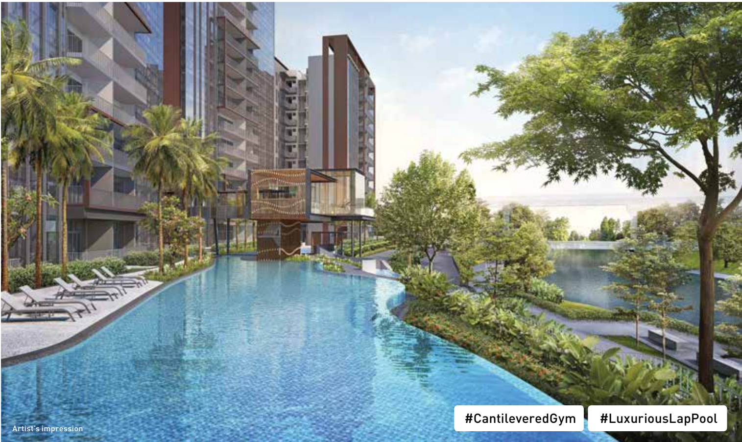
50m Lap Pool

THE WATERFALLS SPECTACULAR VIEWS ABOVE, TRANQUIL WATERS BELOW