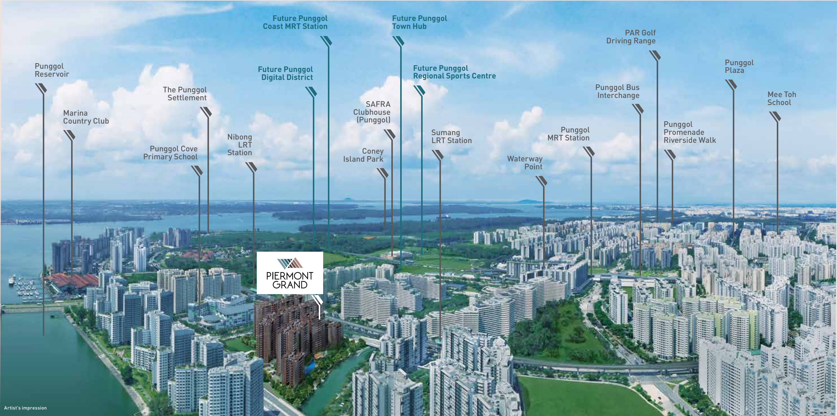
The locations of future and existing amenities indicated in the photograph are approximate and for reference only.