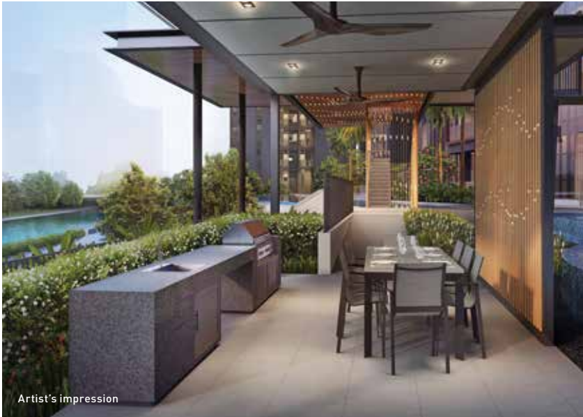
Lookout BBQ Pavilion

THE WATERFALLS SPECTACULAR VIEWS ABOVE, TRANQUIL WATERS BELOW