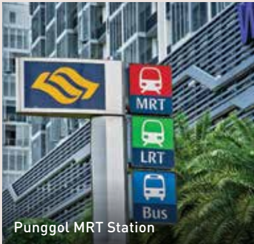
Punggol MRT Station