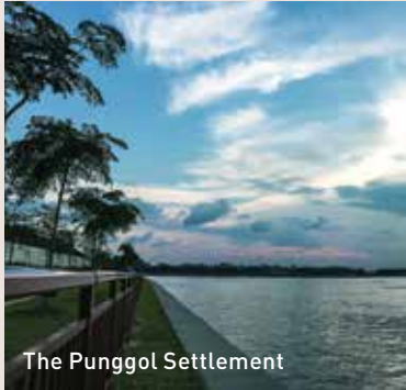
The Punggol Settlement