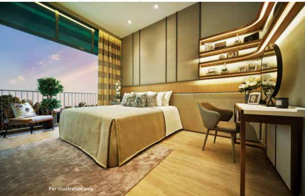
A stylish sanctuary for restful slumber

Go from being a master chef to becoming the perfect host for dinner gatherings with branded kitchen appliances from Teka. For the 4- and 5-bedroom units, a kitchen island is also provided to further complement your ideal home.