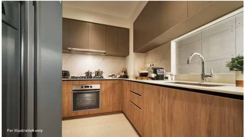
Well-equipped for culinary delights with branded appliances

Go from being a master chef to becoming the perfect host for dinner gatherings with branded kitchen appliances from Teka. For the 4- and 5-bedroom units, a kitchen island is also provided to further complement your ideal home.