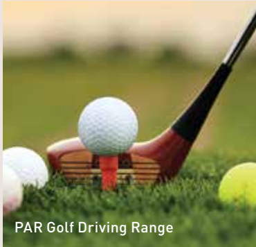
PAR Golf Driving Range