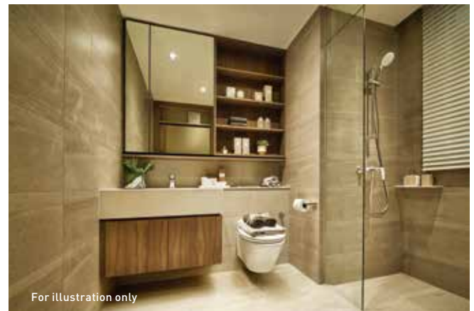
Luxurious bathroom with quality fittings

Before relaxing in the bedroom, you can unwind with a shower in a bathroom that comes equipped with quality fittings from GROHE. Discover an attractively curated accessory cabinet and full-height mirror integrated within your master bedroom wardrobe. For selected units, you can even delight in a roomy walk-in wardrobe space.