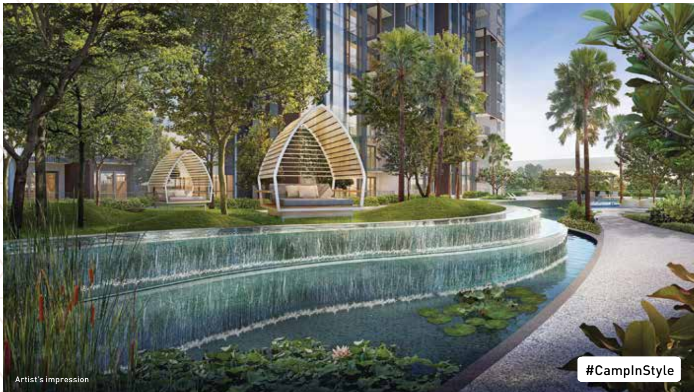
Rolling Lawn and Cabanas

Chill out under the stars on a verdant lawn. Glamp out in your pick of quaint Cabanas. Step into the Hydrotherapy Pool to relieve sore muscles with a relaxing spa experience.