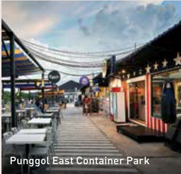
Punggol East Container Park